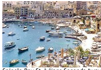
Spinola Bay St Julians Seconds Away