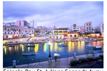
Spinola Bay St Julians Seconds Away

A Large Selection Of Malta & Gozo Holiday Apartments, Villas, Guesthouses and Hotels are available on www.inside-malta.com